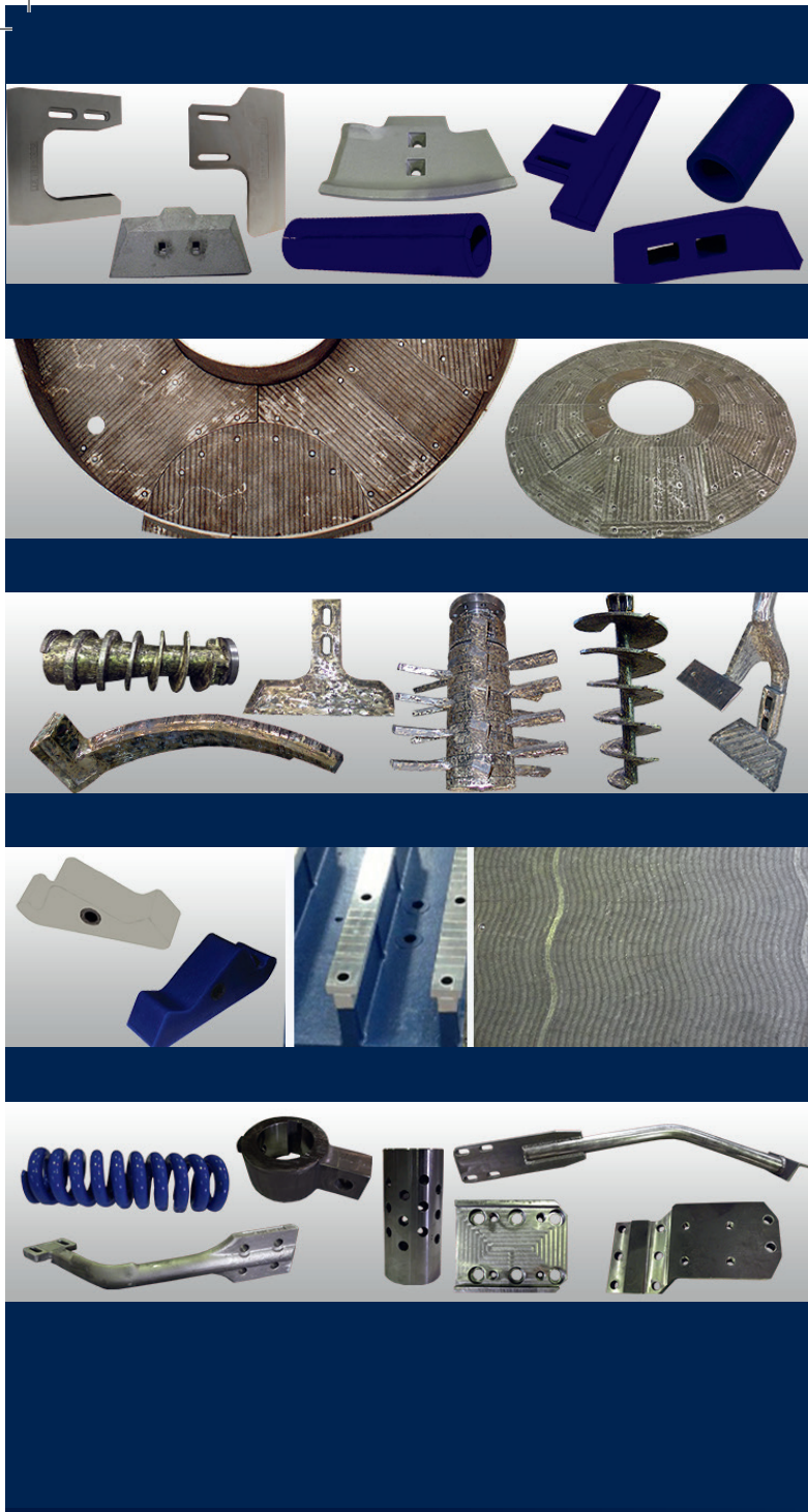
Range of Products