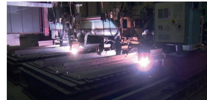
THE WEAR PROTECTION MANUFACTORY