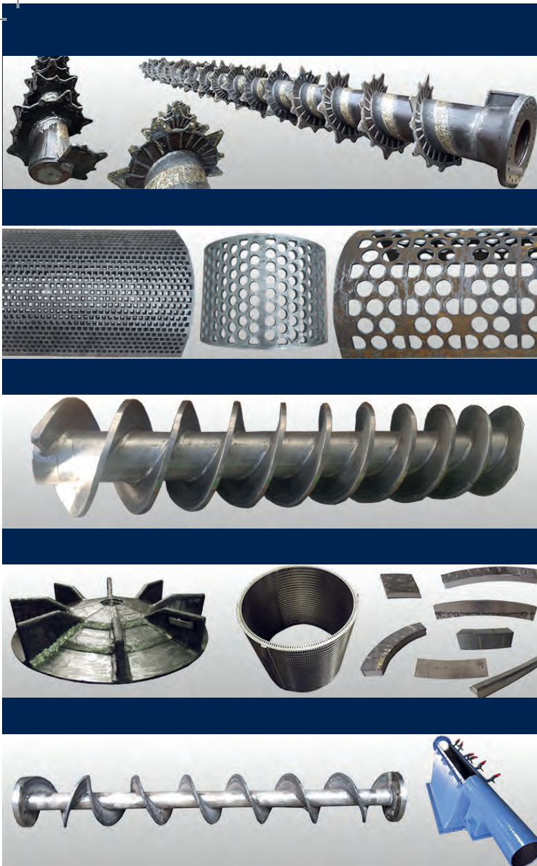
Range of Products