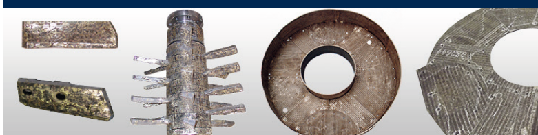
Range of Products