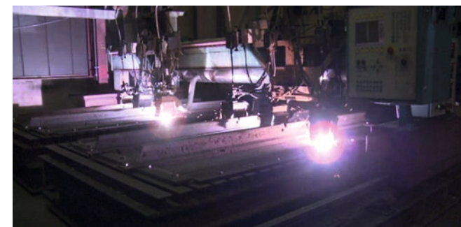
THE WEAR PROTECTION MANUFACTORY