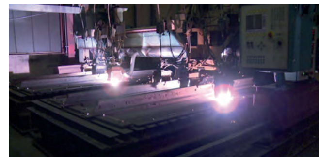
THE WEAR PROTECTION MANUFACTORY